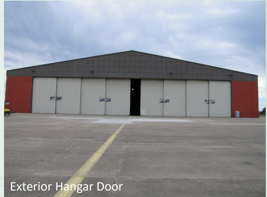
Exterior Hangar Door