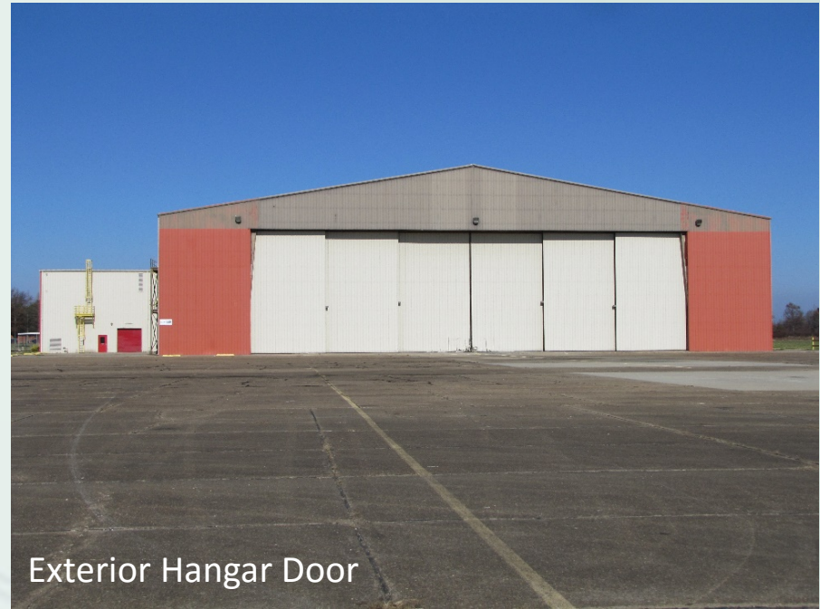
Exterior Hangar Door