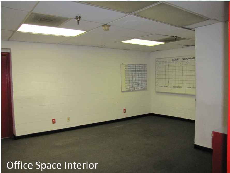
Office Space Interior