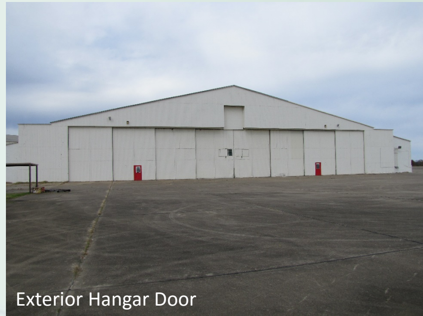
Exterior Hangar Door